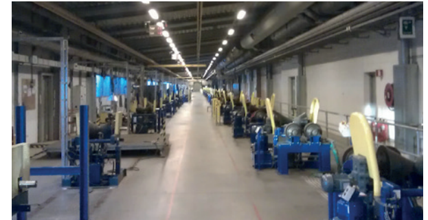
On the right the double joint line, on the left the main line fabrication line

Vigra spoolbase hotel, we have constructed a 100 bed room hotel on the Vigra spoolbase site, this will house 100 fabrication personnel.